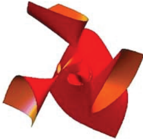
FIGURE 1. The Craighero–Gattazzo quintic